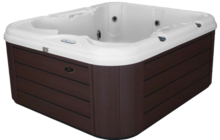
Shell: White | Cabinet: Mahogany