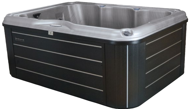
Shell: Eclipse | Cabinet: Black